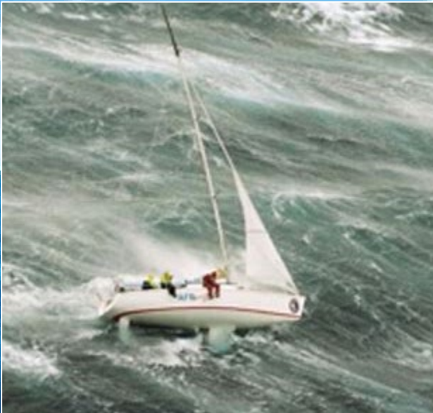
German yacht "Barracuda" lost in a storm

Tom, Brett and Annamaria go to America. Tom is navigator on a yacht for a big race.