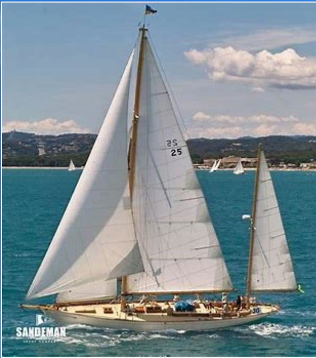
Sailing yacht "Fair Weather" rigged as a yawl.