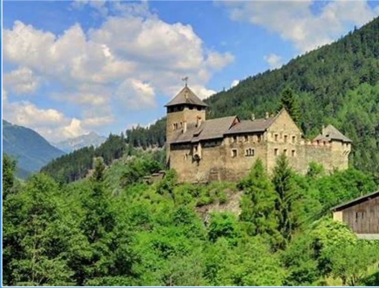
Burg Holstein, an Austrian castle