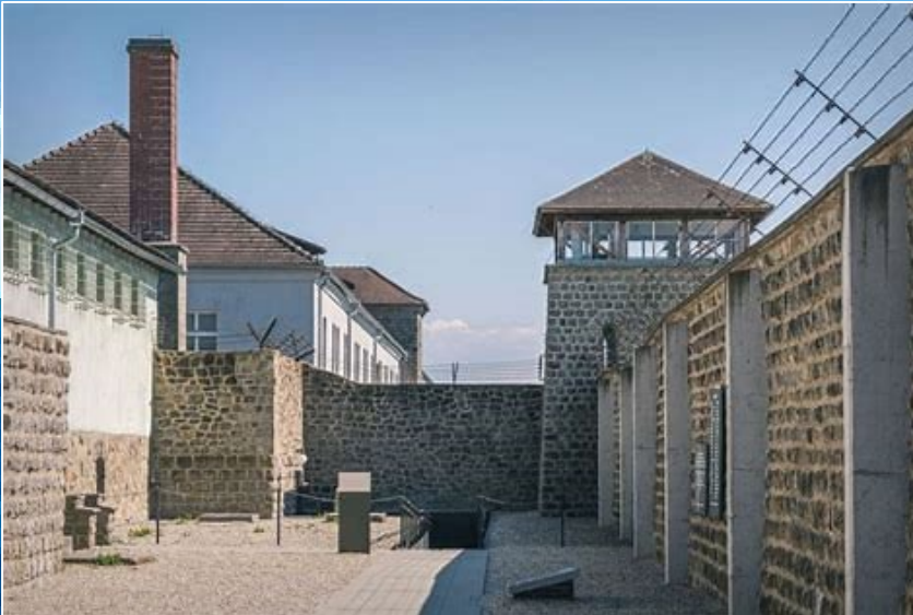
Mauthausen Concentration Camp