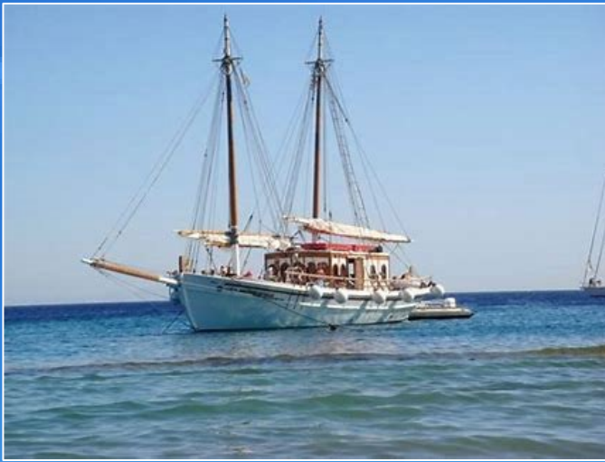
Caique A traditional Greek fishing boat