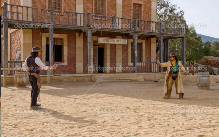
Gunfight at Ten Mile Inn