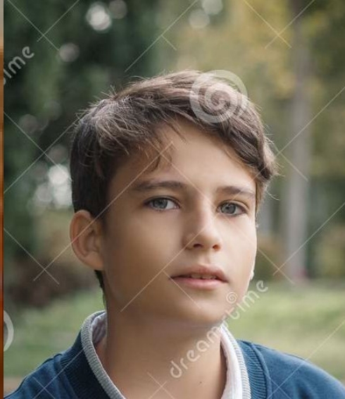
Skye ( 13)

Early 1920's amidst the mountains of Wyoming, the Hill Family finds a place to stay in a failed, old inn built on disputed Arapaho land.