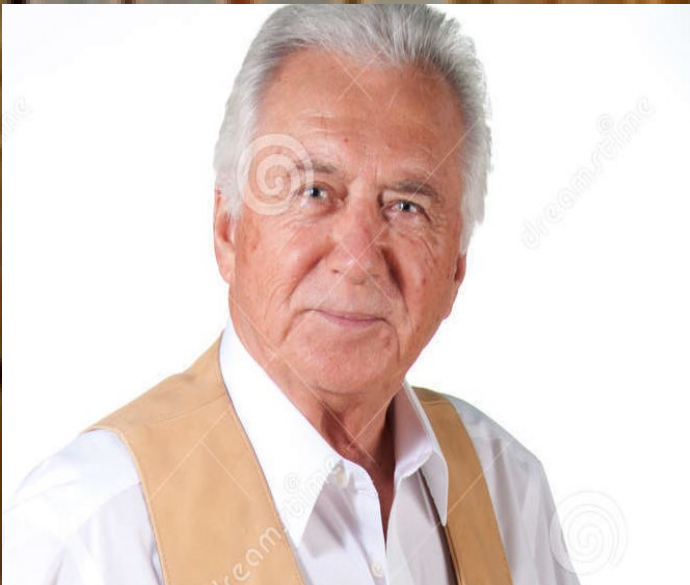
White Owl (82)