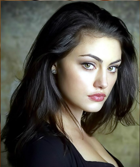
Cocheta ( 32)