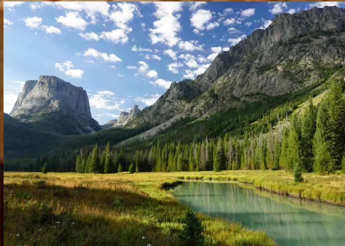
Mountains of Wyoming

At the inn, Carma has an encounter with the spirit of Skye and learns about Rattle's murderous rampage. Skye is horribly disfigured, but Carma can't see him.