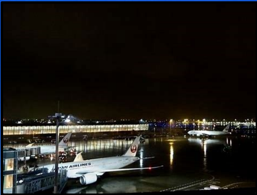
On the tarmac