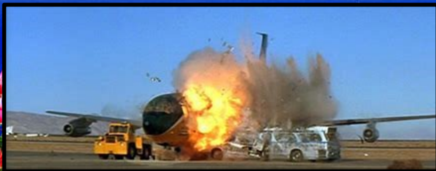
Somebody throws the ashes into an engine.

The bizarre séance led by Margo reveals that the ashes are baked into the material of one of the urns left behind.