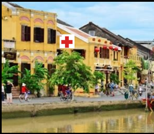
Quan La Hotel