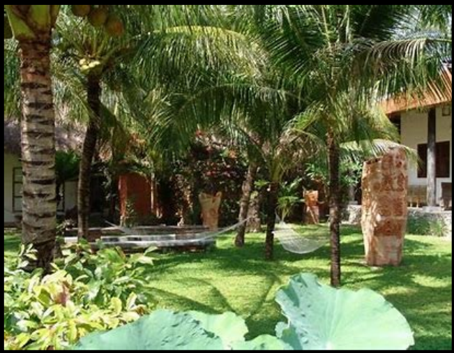
Cobra De Mer House