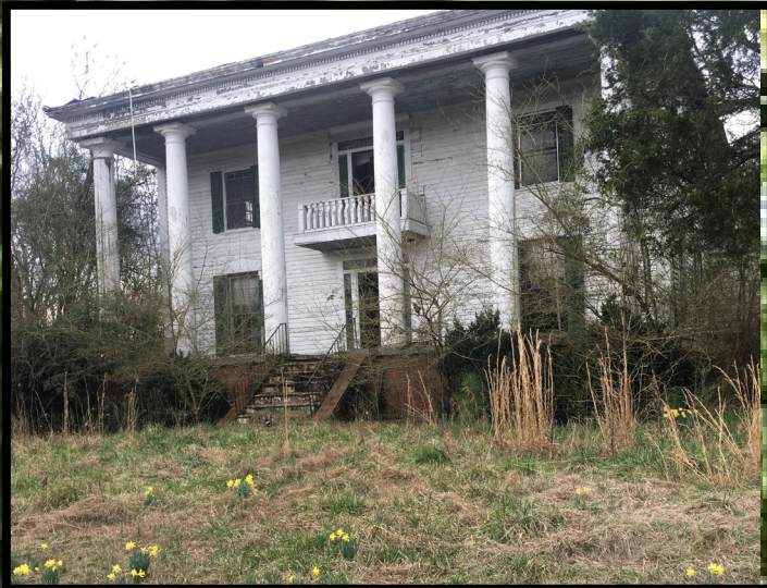
Abandoned D'Rouge Plantation House