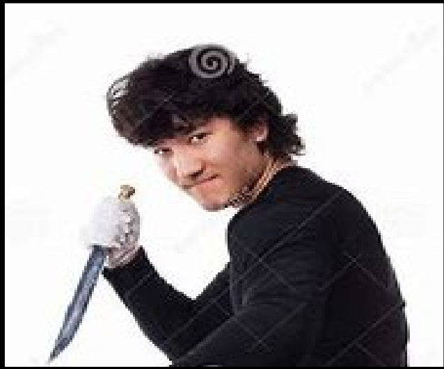
Tach the Knife

They are joined by RAY, always in trouble, recently out of the Navy, who wants to “fight with the Mud Fox”.