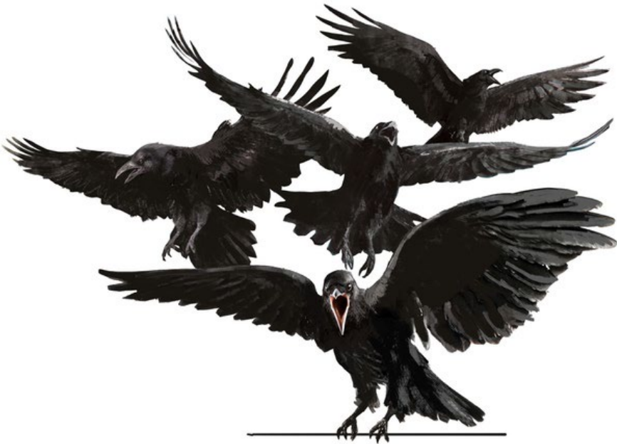
Swarm of Ravens

Eve expects Stone to protect her, but he freaks out when a swarm of ravens attack the house.