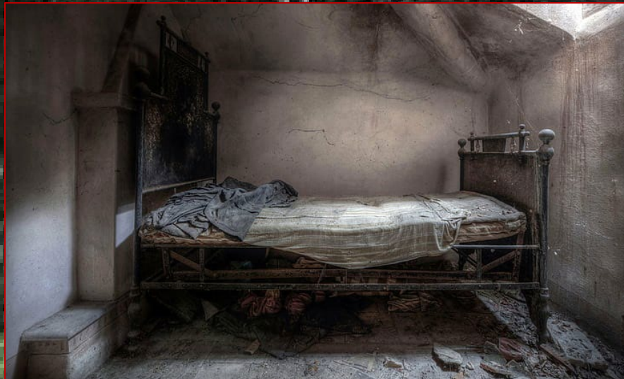
OLD STORAGE ROOM

Eve thinks she is healing Stone. In reality, his leg is being healed by Jasmine who is not really dead.