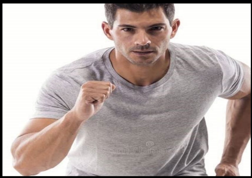
ETHAN KURT (26)

Oak finds Ava, still as hot as ever. He's disappointed to find she has married his old friend, ETHAN, while he was deployed in the Marine Corps.