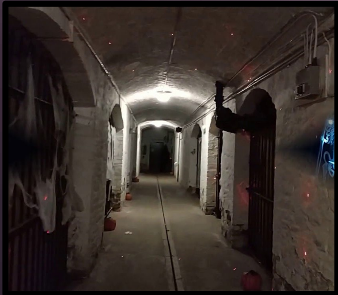
Vault where Riona is imprisoned

Sheriff Tatem investigates the incident on the balcony and is suspicious about what happened to Riona and Hector.